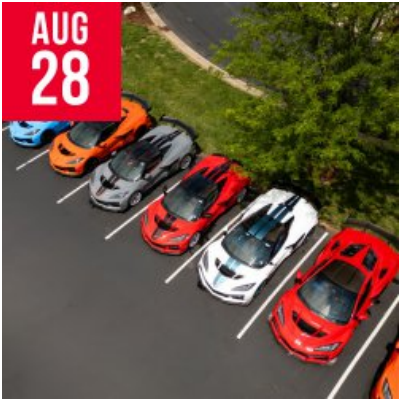
31st Anniversary Celebration August 28-30, 2025