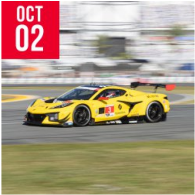
Corvette Racing Weekend October 2-4, 2025