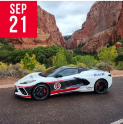
Museum in Motion: National Parks September 21-27, 2025