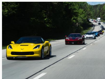
2024 Corvette Caravan