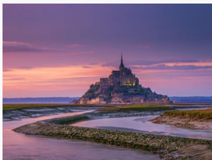
MiM Le Mans Tour