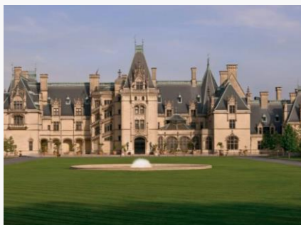
MiM Dragon Run